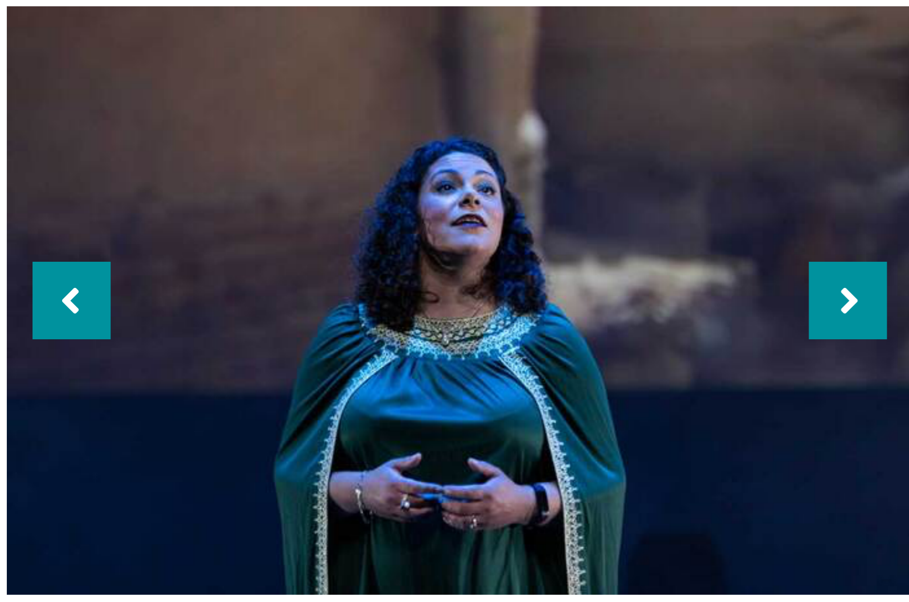
Mami Wata at the Linbury Theatre, Royal Opera House, London.

REVIEWS JUL 19, 2021 BY CLAIRE SEYMOUR LINBURY THEATRE, ROYAL OPERA HOUSE, LONDON